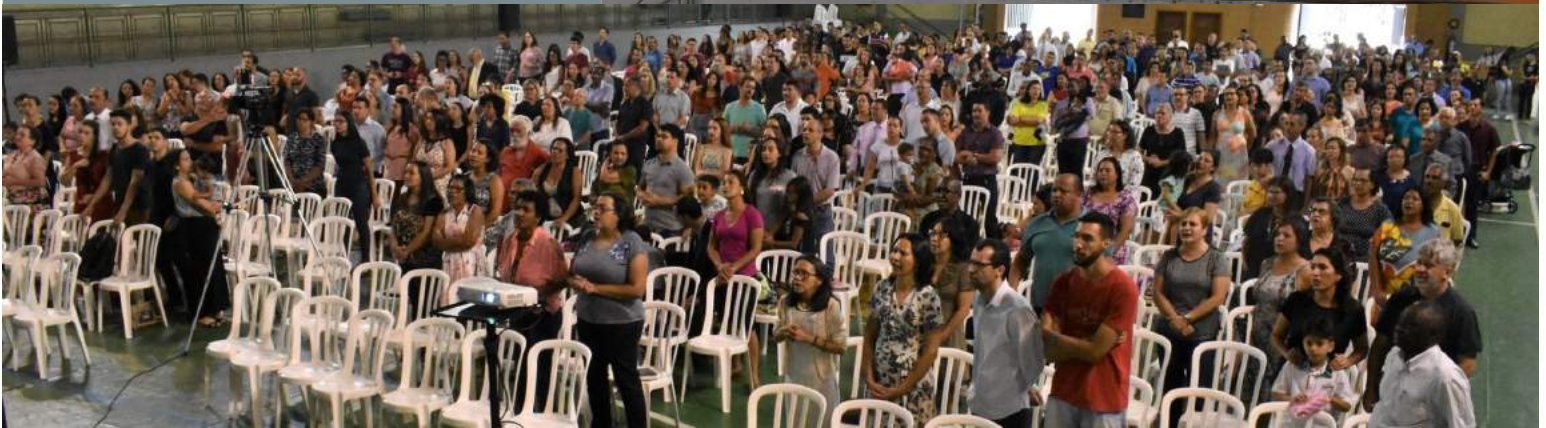
In September we had our "Family Worship Service!" (Pictures above) Almost 600 people from all over the city of Belo Horizonte were present! God is amazing!