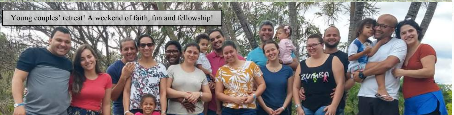
Young couples' retreat! A weekend of faith, fun and fellowship!